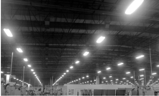
Figure 3. Switch to Fluorescent Lighting

Based on research findings workshop management decides to install fluorescent lighting (Figure 3).